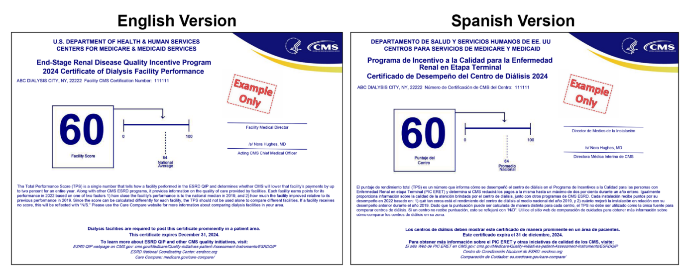
Figure 9: English and Spanish PSCs

To view the final ESRD QIP reports and scores in the ESRD QIP UI in <u>EQRS</u>, you must have a QIP role within EQRS. For instructions on obtaining access to EQRS, refer to the Managing EQRS Access section of this guide. If you have EQRS access but do not have the QIP role, you must request access via the Request Access link in EQRS (Figure 8). For complete instructions on requesting the QIP role in EQRS, refer to the <u>PY 2024 ESRD QIP UI Quick Start Guide</u>. For ESRD QIP final period training, including information on accessing PSRs and PSCs in the ESRD QIP UI in EQRS, refer to the training <u>video</u> and <u>slides</u> available on the <u>Events</u> page on <u>www.MyCROWNWeb.org</u>.